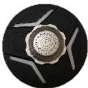
Volume + Power Button